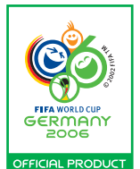
Fujifilm – Official Imaging Sponsor of 2006 FIFA World Cup Germany™