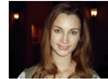
Conventional digital camera

Red-eye removal eliminates any unsightly red-eye reflections to ensure flattering flash portraits and party pictures.