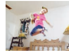
Conventional digital camera

Reduces image blur caused by handshake or when photographing moving subjects to deliver crisp, sharp images.